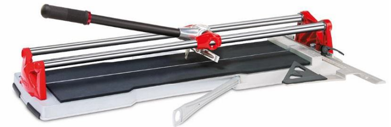
Speed-72 / 92 Magnet